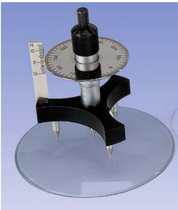
Fig. 2: Measurement set-up