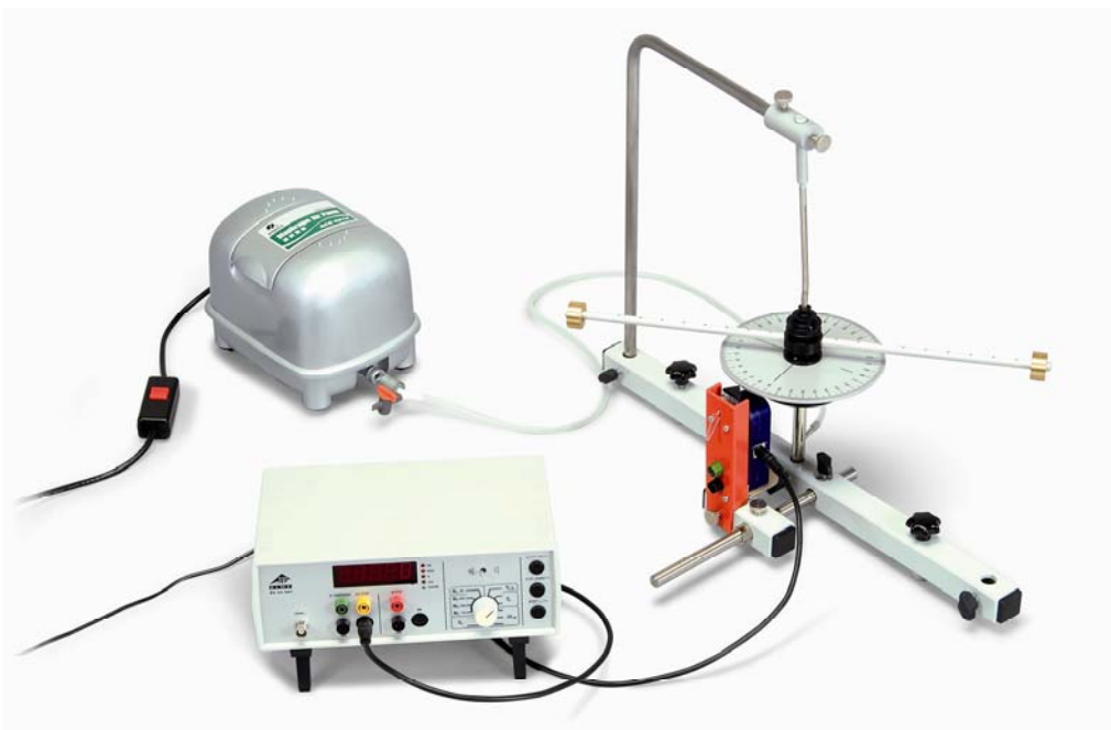
Fig. 1: Experiment set-up for determining the moment of inertia by the torsional oscillation method

Thus, the greater the moment of inertia J of the disc with the attached horizontal rod, as dependent on the mass m and the distance r , the longer the period of oscillation T .