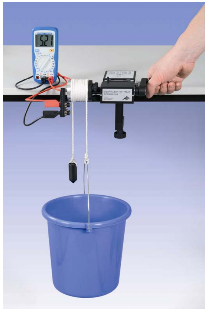
Fig. 1: Experiment set-up