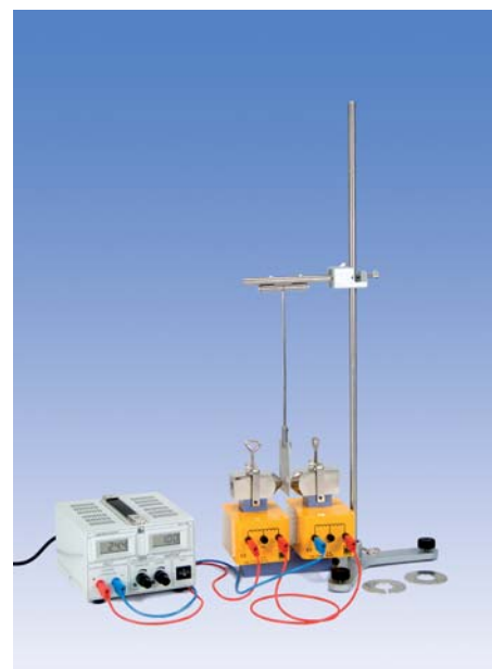
Fig. 2 Set-up Waltenhofen's pendulum