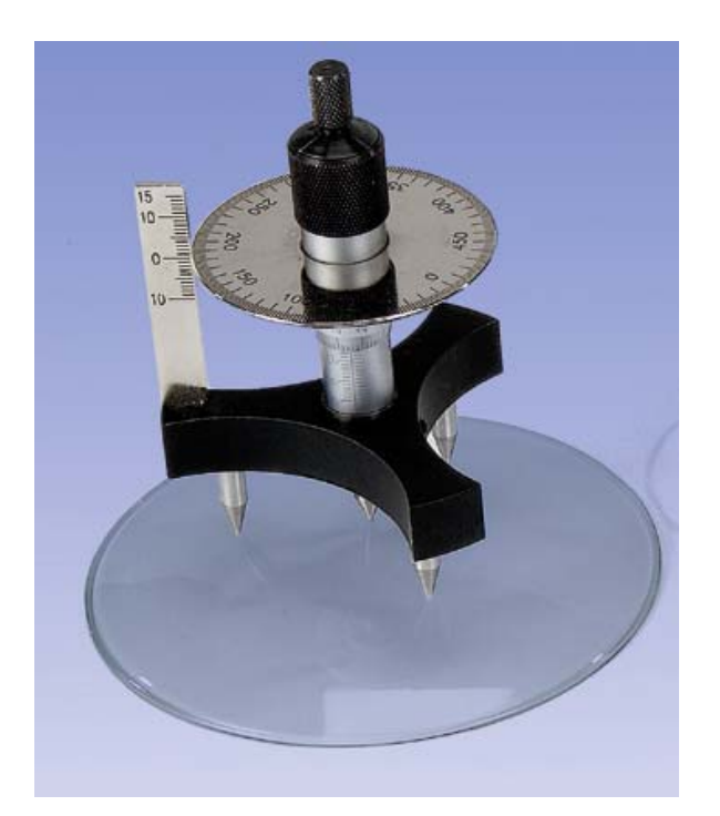
Fig. 2: Measurement set-up