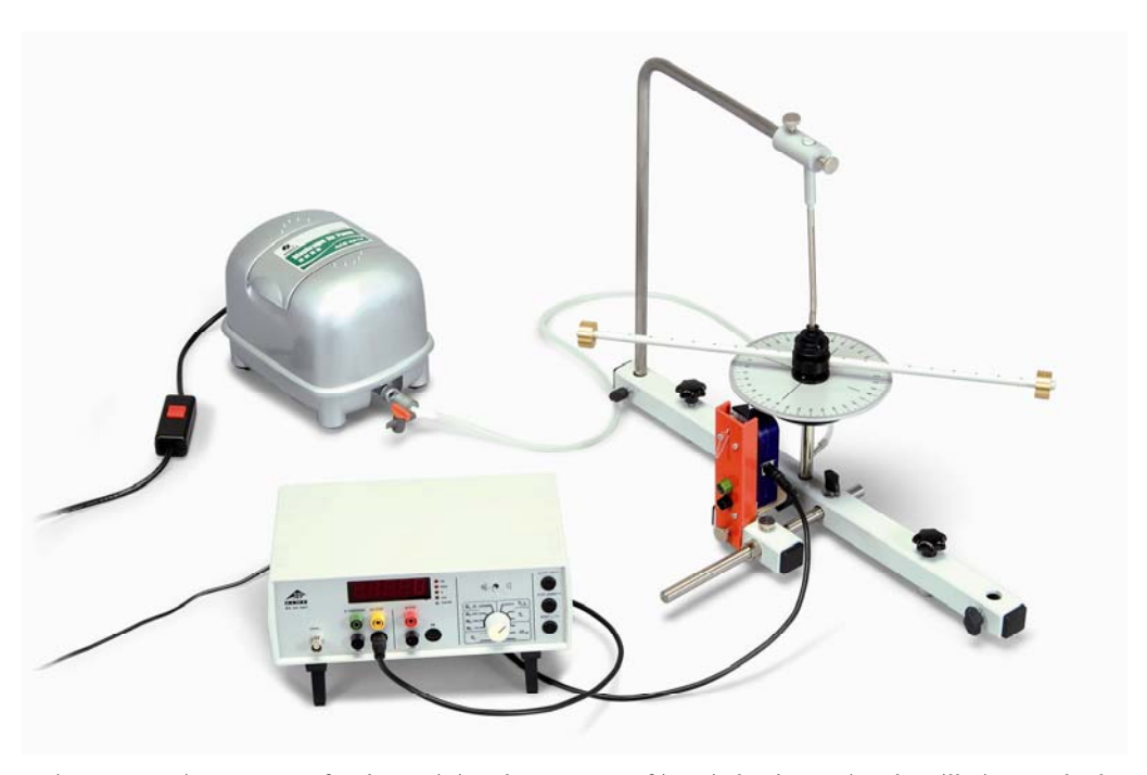
Fig. 1: Experiment set-up for determining the moment of inertia by the torsional oscillation method

Thus, the greater the moment of inertia J of the disc with the attached horizontal rod, as dependent on the mass m and the distance r, the longer the period of oscillation T.