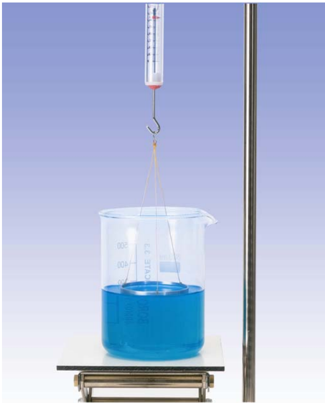
Fig. 3: Experiment set-up for surface tension measurements