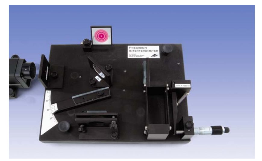
Fig.1: Experiment set-up for determining the refractive index of glass using a Michelson interferometer

By making a slight modification, the Michelson interferometer can be converted into a Twyman-Green interferometer, an instrument for measuring the surface quality of optical components. A Twyman-Green interferometer is normally understood to mean an instrument in which the (laser) light beam is expanded and formed into a parallel beam. However, for the qualitative understanding of the principle, a beam that is divergent rather than parallel can be used.