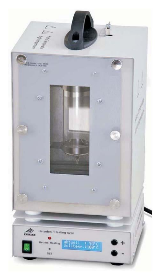
Fig. 1 Heater panel with sodium fluorescence tube attached to heater