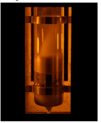
Fig. 2 Mist inside sodium light

Note 1: The ends of the metallic sodium reflector inside the tube will move during the course of the experiment. One thing that can improve the situation is to align the tube such that the end where condensation takes place is facing downwards. In that case, the sodium "mist" can be seen especially clearly at the top edge of the metallic coating.