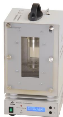
Fig. 2 Heating Chamber with sodium fluorescence tube (1000913)