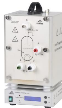
Fig. 1 Heating Chamber with Franck-Hertz tube with Hg filling (115 V: 1006794, 230 V: 1006795)