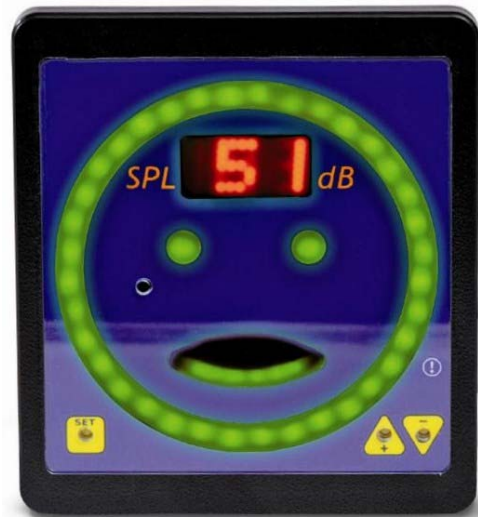
Fig. 1 Display with “happy smiling face”