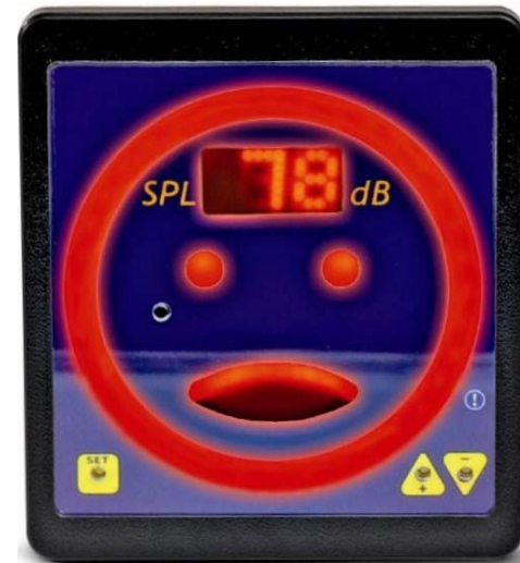
Fig. 2 Display with “frowning face”