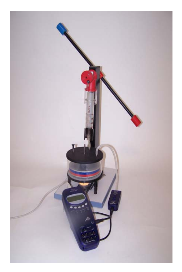
Fig. 1 Experiment set-up for recording operating pressures in the Wilke-type Stirling engine while in motion