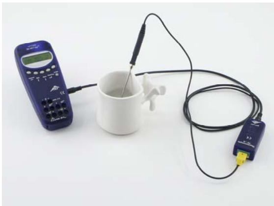
Fig. 1: Experimental demonstration of Newton's law of cooling

The type K immersion sensor U11854 is used in this experiment.