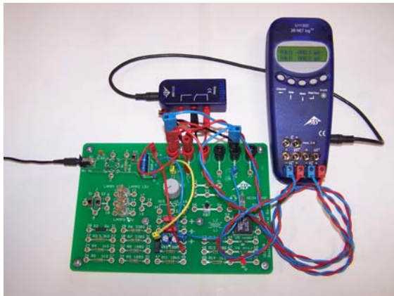
Fig. 1: Measuring the discharge of a capacitor

Various experiment leads with 2-mm and 4-mm plugs