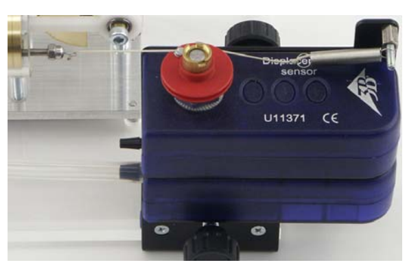
Fig. 7 Poorly aligned sensor holder whereby the string sags at full extension

• Slowly turn the Stirling engine by hand and check that none of the moving parts catch on the sensor holder. Make sure, too, that the pulley does not turn to its limit and that it is not touched by the spring. If the spring does touch the pulley, it will be extended too far when the working piston is at the limit of its movement.