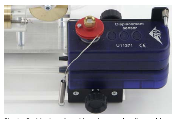
Fig. 4 Positioning of working piston and pulley and how to thread the string

Move the working piston and the pulley to the centre of their movement. Wrap the string around the pulley and attach the spring to the threaded rod. The string needs to go around the small screw on the pulley.