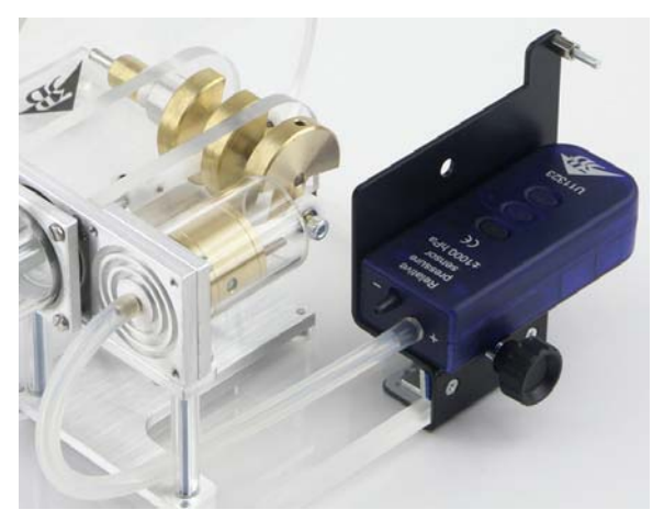
Fig. 2 Assembly of pressure sensor

Screw the cap nut attached to the string onto the threaded rod of the working piston and fit the displacement sensor in the top hole using a knurled screw.