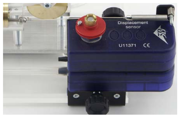
Fig. 6 Alignment of sensor holder

Move the working piston out all the way, then move the sensor holder in such a way that the spring is at its minimum extension. The attachments should be aligned such that the spring, the string and the working piston all move in the same plane.