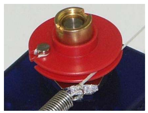
Fig. 5 How the string is threaded around the pulley

Move the working piston out all the way, then move the sensor holder in such a way that the spring is at its minimum extension. The attachments should be aligned such that the spring, the string and the working piston all move in the same plane.