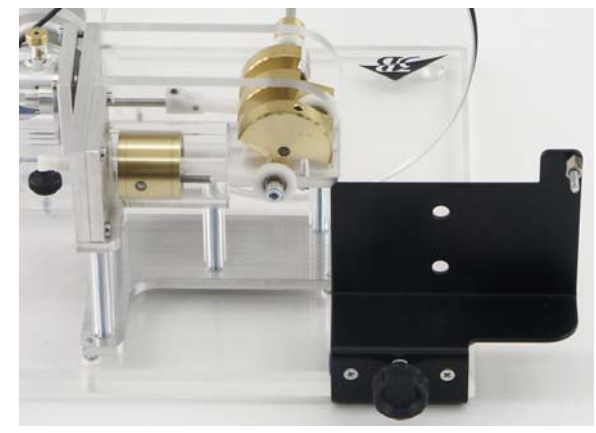
Fig. 1 Assembly of sensor holder

Attach the sensor holder to the base plate of the Stirling engine as illustrated.