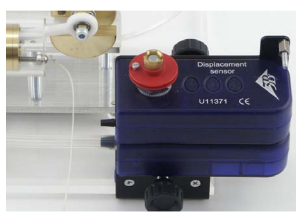
Fig. 3 Attachment of string to working piston and assembly of displacement sensor

Screw the cap nut attached to the string onto the threaded rod of the working piston and fit the displacement sensor in the top hole using a knurled screw.