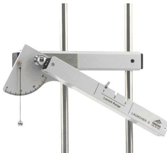
Fig. 2 Experiment set-up for oblique launching