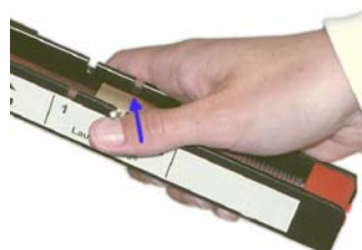
Fig. 1 Releasing the launch mechanism