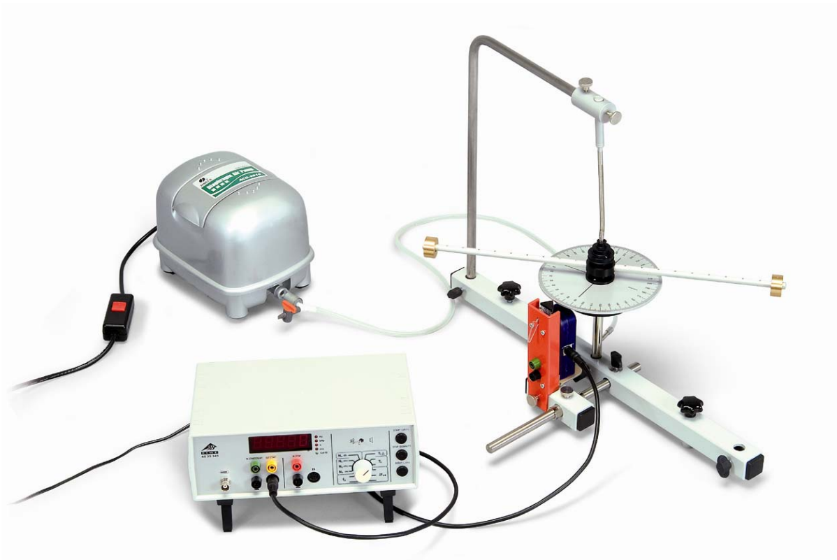
Fig. 2 Experiment set-up for determining moment of inertia of transverse beam with additional masses, using a laser reflection sensor (U8533380) and a digital counter (U8533341).