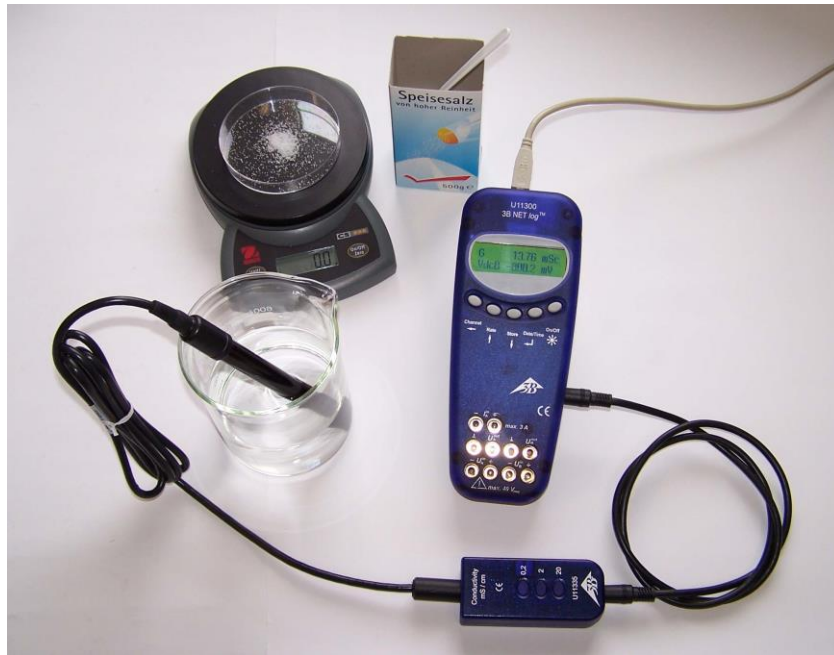
Fig. 1 Set-up for increase in conductivity of distilled water due to addition of common salt