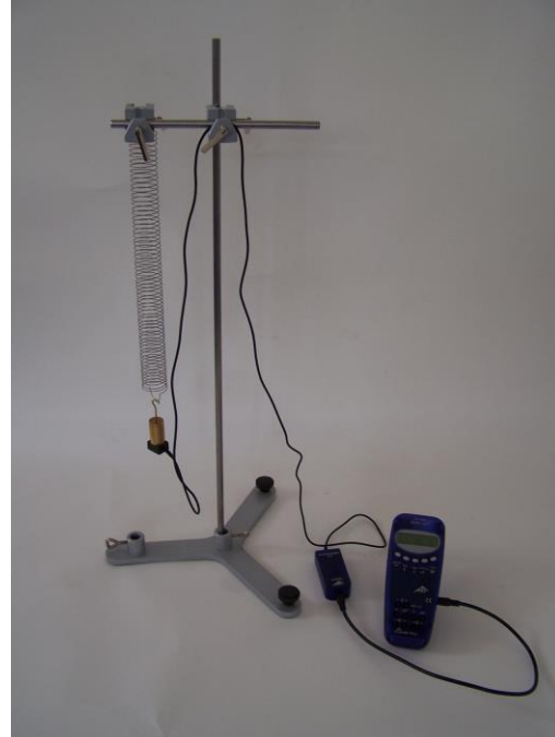
Fig. 1 Acceleration measurement for a damped oscillation of a mass on a spring