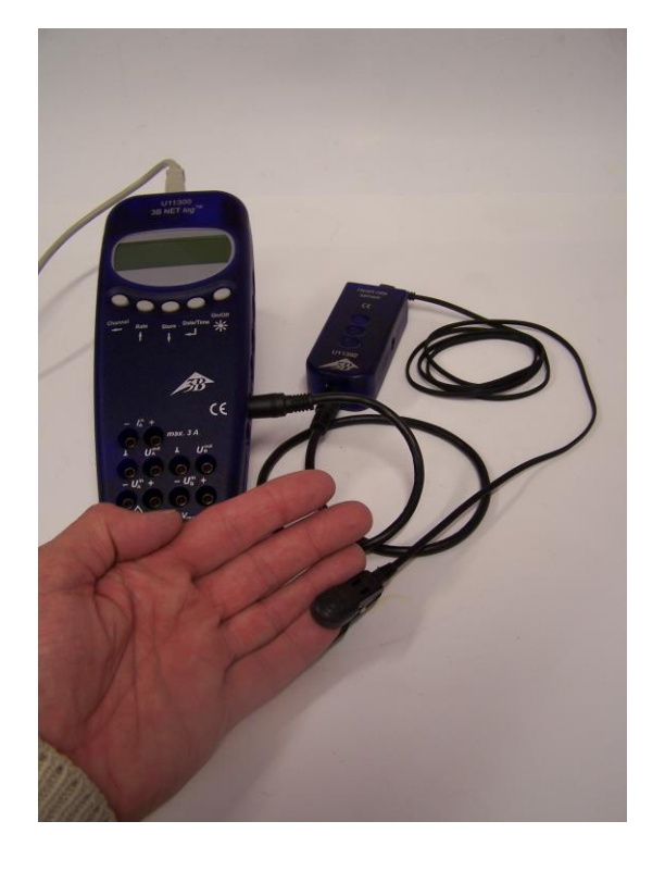
Fig. 1 Measurement of a person's pulse rate