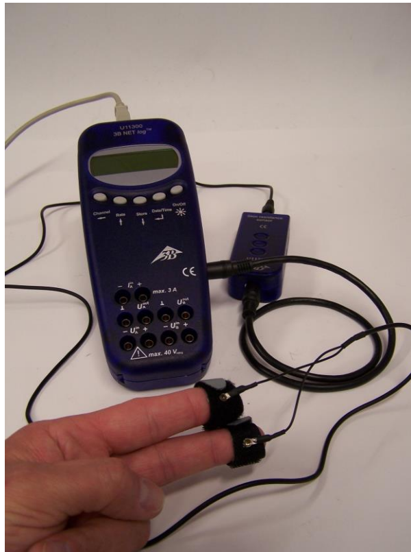
Fig. 1 Measuring skin resistance of a person