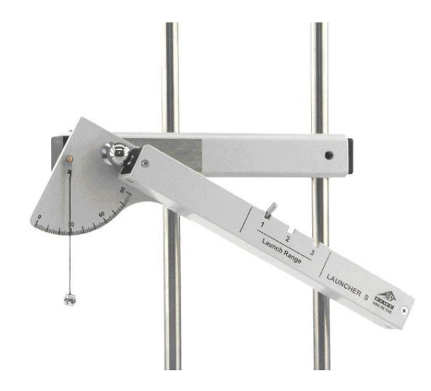
Fig. 2 Experiment set-up for oblique launching