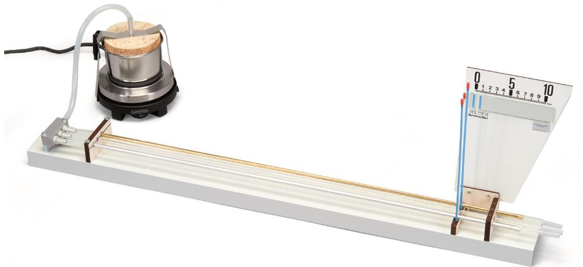
Fig. 1 Experimental set-up

where l is the length of the tube measured from its fixed bearing up to the pilot bearing.