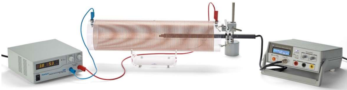
Fig. 1: Measurement set-up