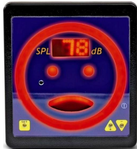
Fig. 2 Display with “frowning face”