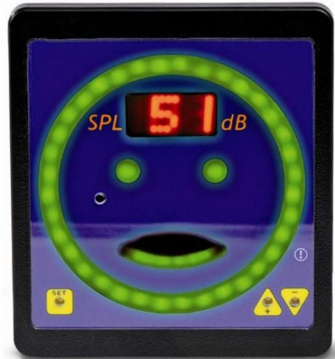
Fig. 1 Display with “happy smiling face”