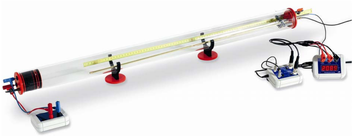
Fig. 2: Experiment set-up with Kundt's tube