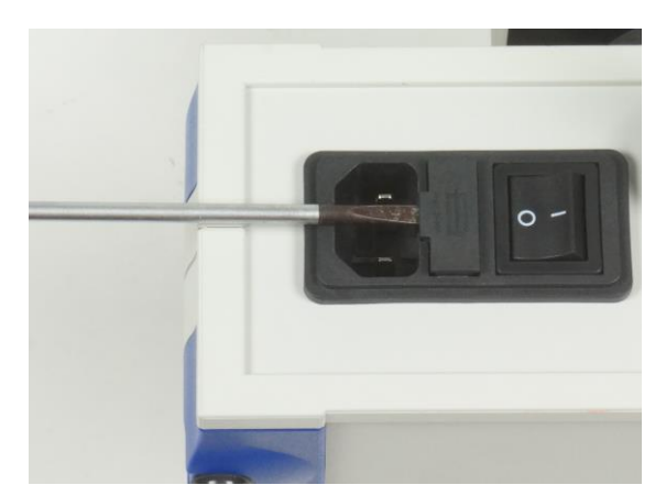
Fig. 1 Changing the fuse

Take out the blown fuse and replace it with a new one of the correct specification. Press the fuse holder back into place.