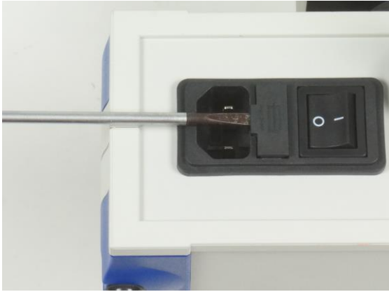
Fig. 1 Changing the fuse