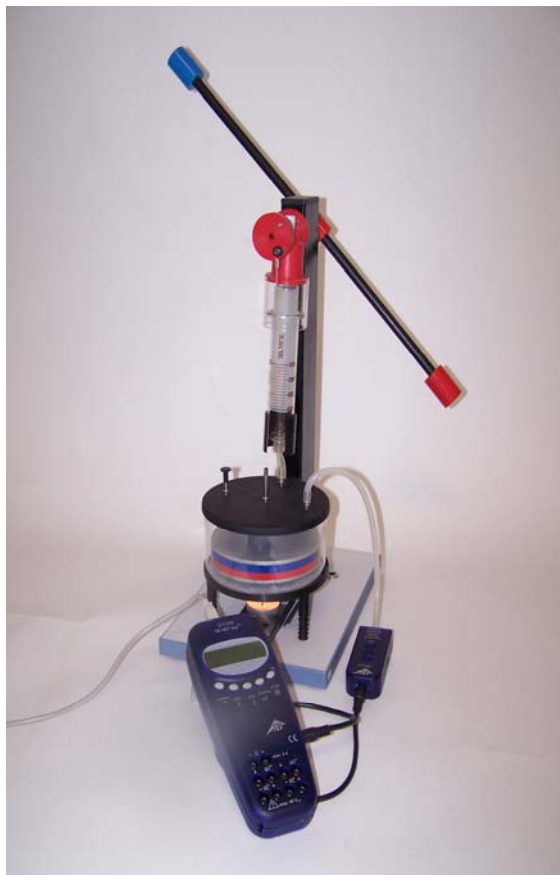
Fig. 1 Experiment set-up for recording operating pressures in the Wilke-type Stirling engine while in motion