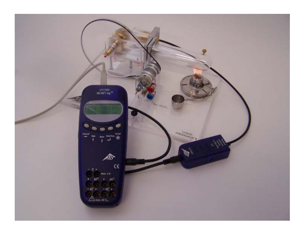
Fig. 1 Experiment set-up for recording operating pressures in Stirling engine U10050 while in motion