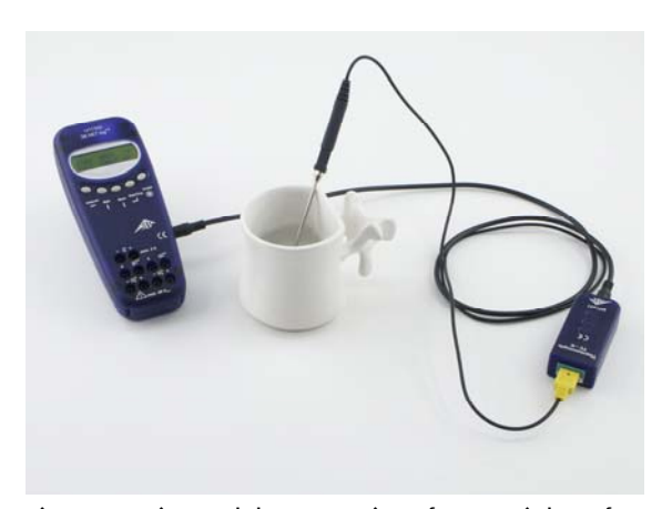
Fig. 1: Experimental demonstration of Newton's law of cooling

The type K immersion sensor U11854 is used in this experiment.