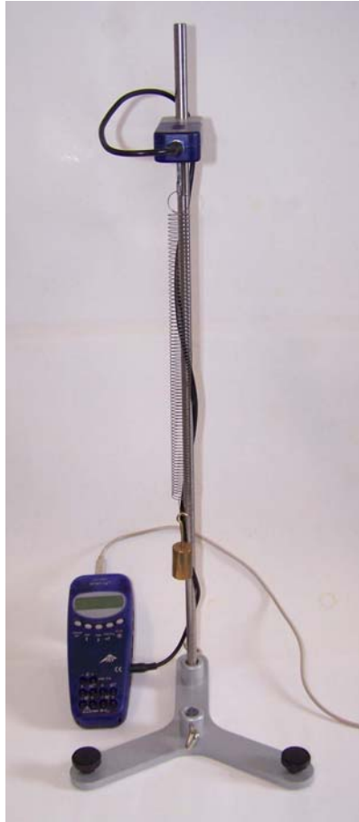
Fig. 1 Measuring the oscillations of a weakly-damped mass-and-spring system