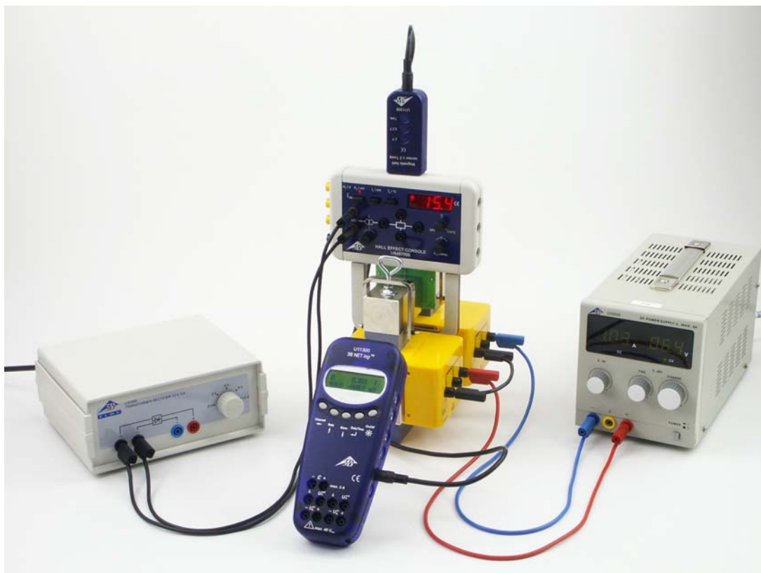
Fig. 1 Measurement of flux density in the air gap between pole pieces of an electro-magnet in an experiment set-up using the basic Hall-effect apparatus