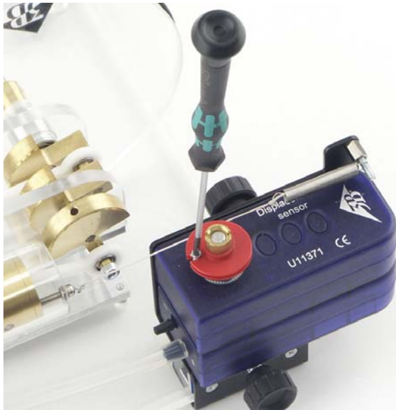
Fig. 8 Securing the string