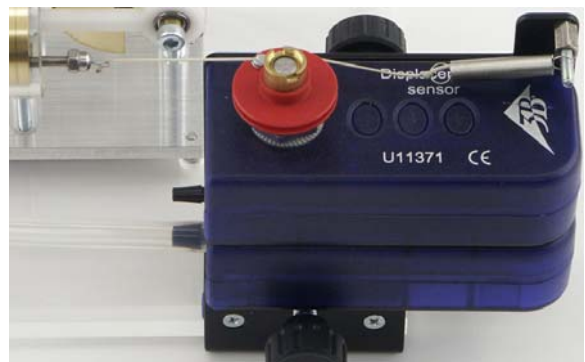
Fig. 7 Poorly aligned sensor holder whereby the string sags at full extension