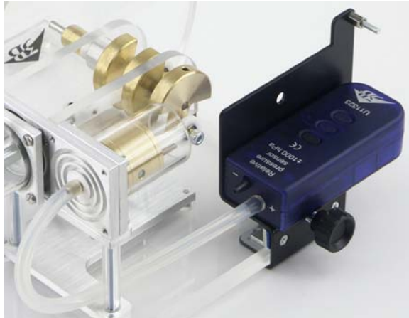
Fig. 2 Assembly of pressure sensor