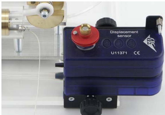
Fig. 3 Attachment of string to working piston and assembly of displacement sensor