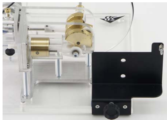
Fig. 1 Assembly of sensor holder