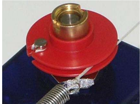
Fig. 5 How the string is threaded around the pulley