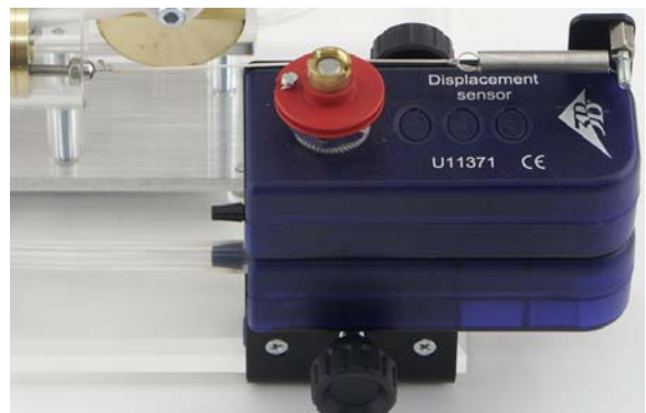
Fig. 6 Alignment of sensor holder