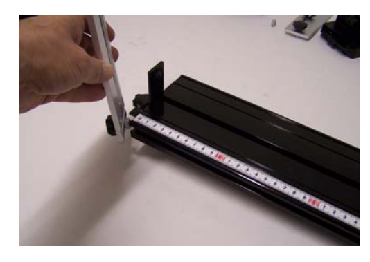
Fig. 14 Inserting the holder for light barrier into the groove at the side of the trolley track