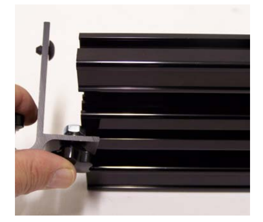
Fig. 2 Inserting the single support into the middle groove at the bottom side of the trolley track.