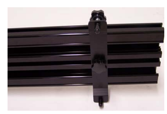
Fig. 6 Mounted double support

• After finishing the set-up of the supports align the trolley track horizontally.