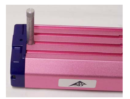
Fig. 24 Mounted contact-breaker