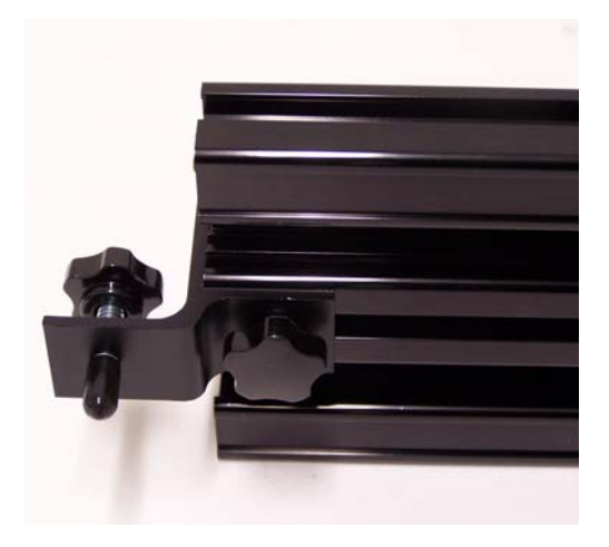
Fig. 3 Mounted single support