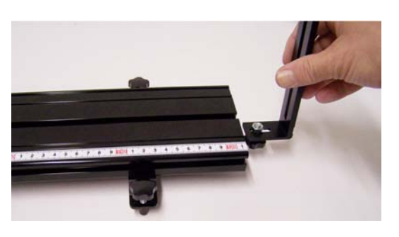
Fig. 8 Inserting the holder for pulley into the middle groove at the bottom side of the trolley track