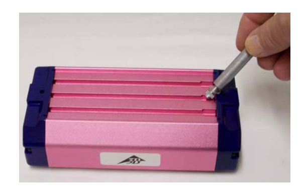
Fig. 23 Inserting the contact-breaker into the groove on the upper side of the trolley