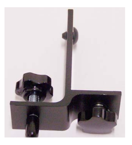
Fig. 1 Single support with end stop

• Putt he trolley track on ist side and mount the two supports at the track as shown in the pic-tures.