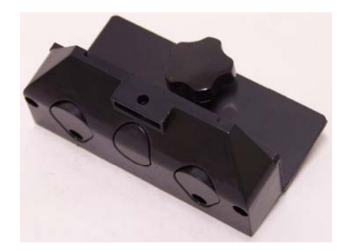
Fig. 10 End stop with holders for magnets