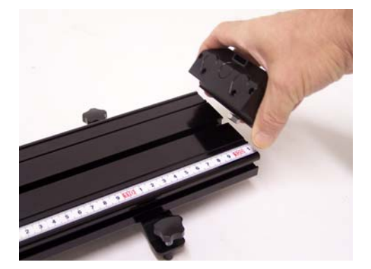
Fig. 11 Inserting the end stop with holders for magnets into the groove on the upper side of the trolley track