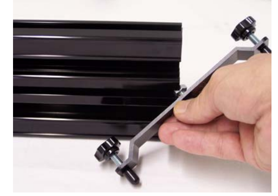
Fig. 5 Inserting the double support into the middle groove at the bottom side of the trolley track.