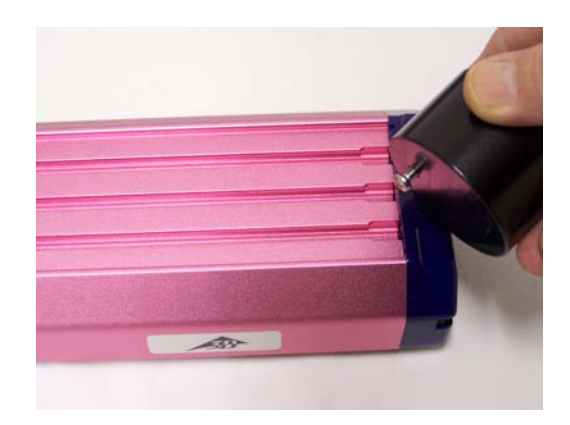
Fig. 21 Inserting the additional weight into the groove on the upper side of the trolley