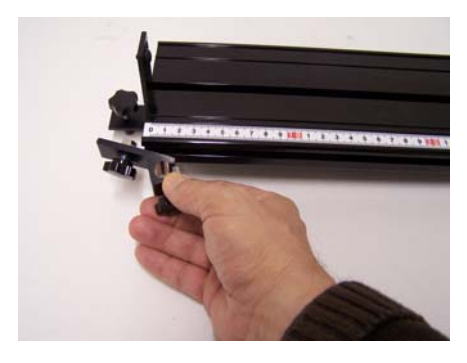
Fig. 18 Inserting the rod clamp into the groove at the side of the trolley track