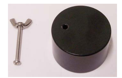
Fig. 20 Additional weight

4.3 Mounting of accessories to the trolley