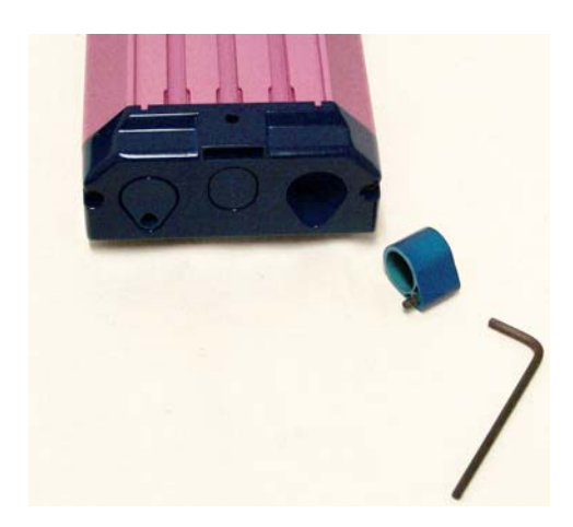
Fig. 25 Removed holder for magnets