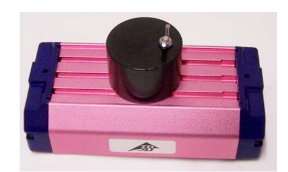
Fig. 22 Mounted additional weight