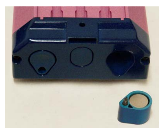
Fig. 26 Magnet inserted into holder