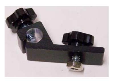
Fig. 17 Rod clamp