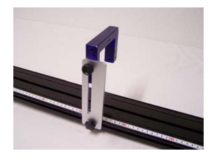
Fig. 16 Mounted light barrier