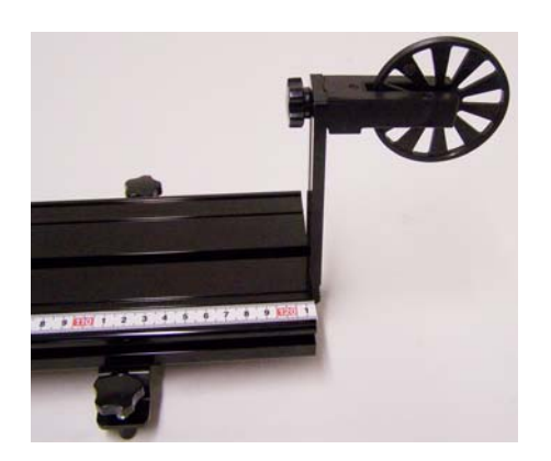
Fig. 9 Mounted pulley