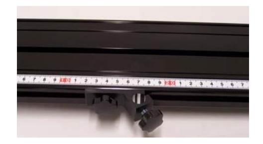
Fig. 19 Mounted rod clamp

4.3 Mounting of accessories to the trolley