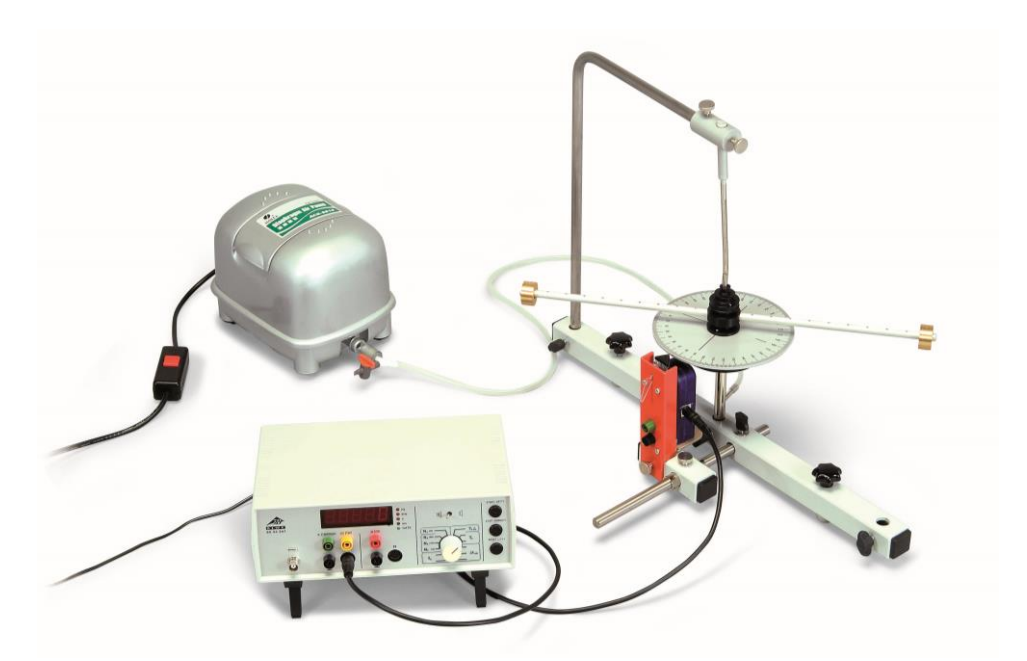
Fig. 1: Experiment set-up for determining the moment of inertia by the torsional oscillation method

Thus, the greater the moment of inertia J of the disc with the attached horizontal rod, as dependent on the mass m and the distance r, the longer the period of oscillation T.