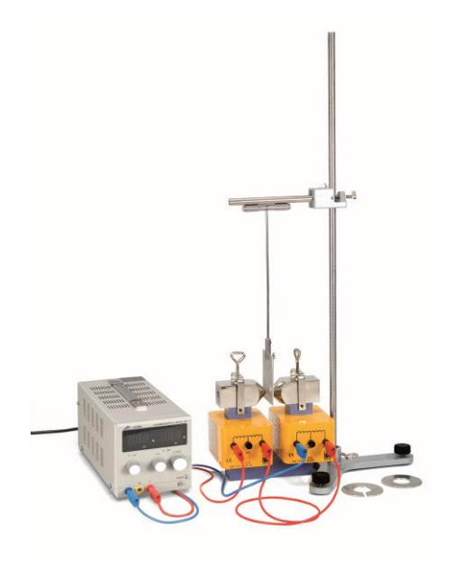
Fig. 2 Set-up Waltenhofen's pendulum